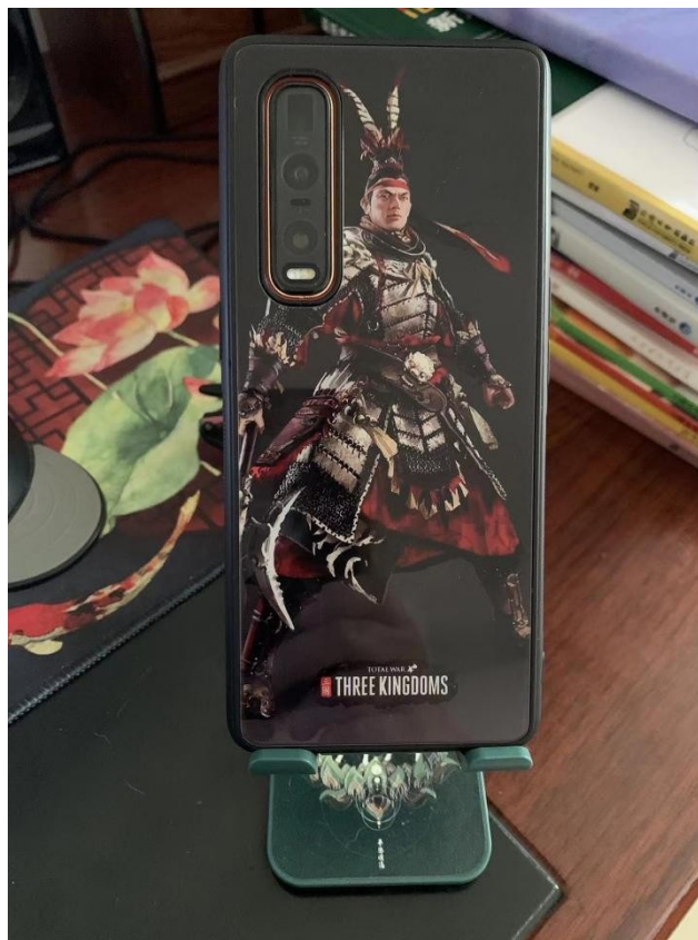
Pic.11. Lü Bu on an Oppo cellphone case.