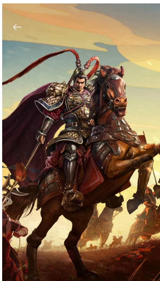
Pic. 10. Red Hare and his rider. The picture serves as a theme for an Oppo cellphone.

So, the horse has gradually come to stay: now it is not only an instrument of the hero’s safe flight from danger, it already starts to be perceived as a part of him being “like a fierce tiger” : an invincible tiger-like warrior riding a mighty horse. Finally, under the magic brush of Luo Guangzhong – who was awesomely good at borrowing seemingly unconnected elements from different sources and weaving them into his own narration, so that they all become meaningful – the horse turns into an agent of its own. It is precisely to get this horse that Lü Bu betrays his former commander, riding this horse duplicates his strength, the loss of this horse precedes his death.