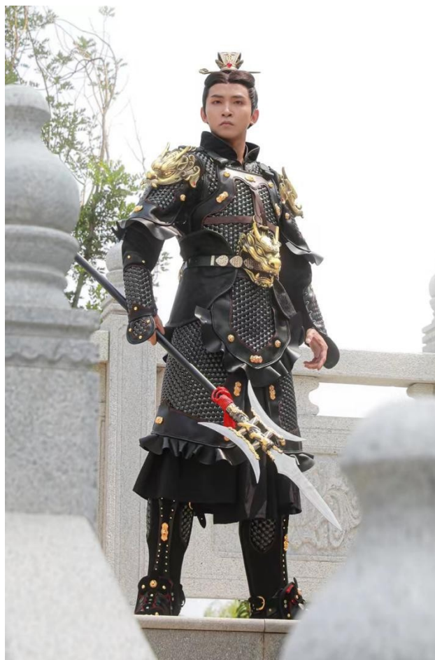
Pic. 2. Cosplay: an image of Lü Bu in a traditional attire.

During the Tang dynasty (618–907 AD), the time of unprecedented flowering of Chinese culture, there was a social demand for free self-expression, when personal talent and the overall informality of the individual were valued above all. In those times the memories of a general from the distant past took the form of praise of his military achievement rather than condemnation of his moral flaws. The poet Zhang Huaiguan (张怀瓘) compares in his ode a brush of a calligrapher with Lü Bu riding a horse: