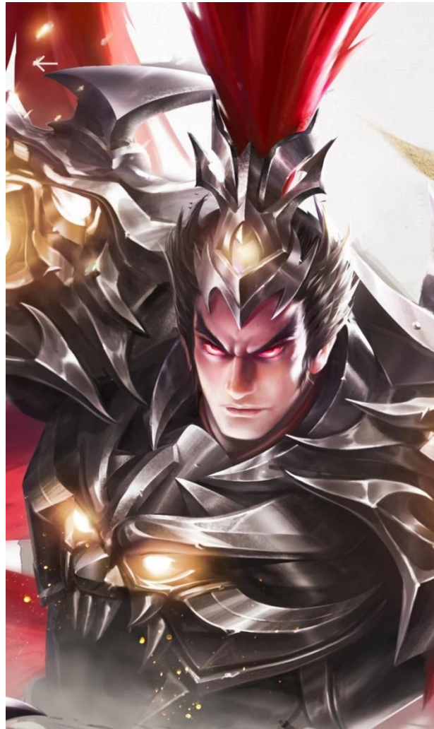
Pic. 3. Lü Bu as depicted in modern art. The picture serves as a theme for an Oppo cellphone.

The total number of plays in which Lü Bu is the main character is eight, second only to the most popular Three Kingdoms characters Zhang Fei and Guan Yü. Those plays are: