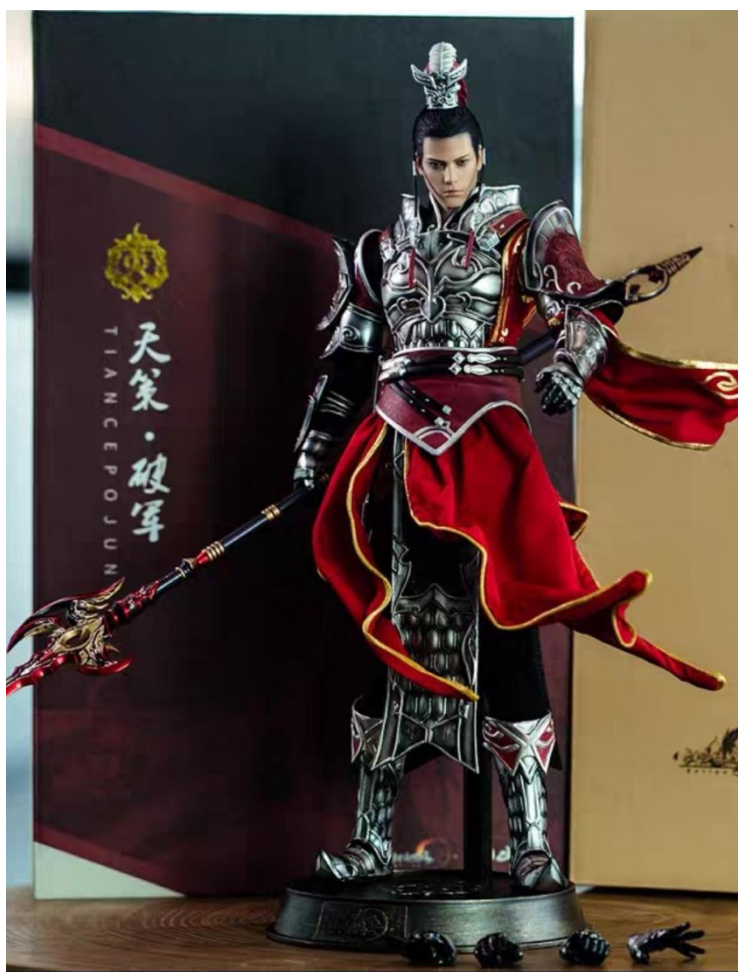
Pic. 4. Lü Bu a doll as displayed in Taobao Internet market.