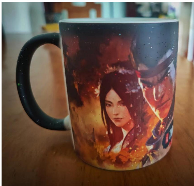
Pic. 10. The “Chain Scheme” characters on a tee mug.