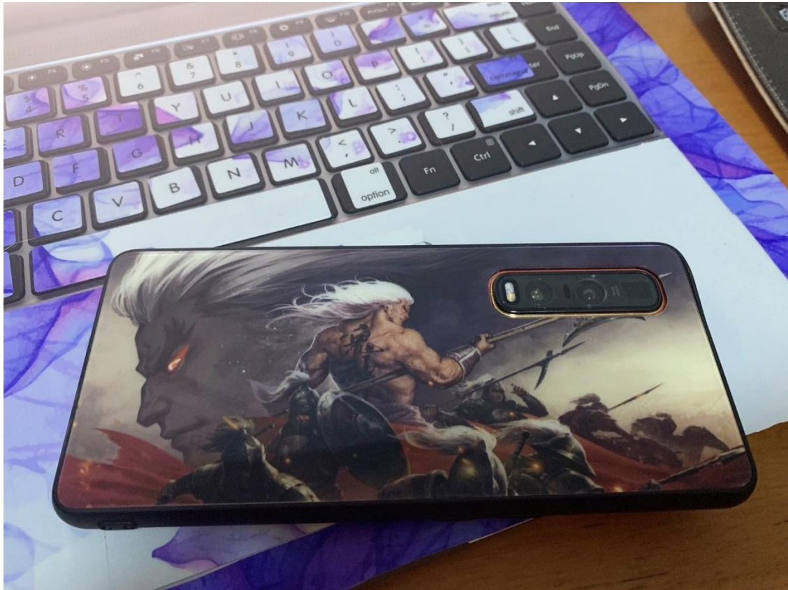
Pic. 7. Lü Bu as envisaged in a computer game. The picture on an Oppo cellphone case. Here the nakedness of the hero renders his superhuman strength, his dangerous temperament and marvelous martial skills.

After learning that his fiancée is in the hands of Dong Zhuo, the enraged Lü Bu bursts into the minister's house ready to cause a scandal. But the minister calms him down by saying that the Chancellor took the girl from his house not for himself but for him, Lü Bu, to arrange a grand wedding for his adopted son. Lü Bu waits a little longer and, tired of waiting, arrives at the usurper's house. There he is introduced to Diao Chan as his adoptive father's new wife. Diao Chan manages to play on two fronts: with the usurper she flirts and pretends to be loving and happy, while with Liu Bu she weeps and plays the victim of violence.