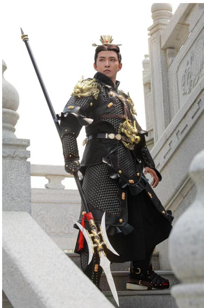
Pic. 6. Cosplay: an image of Lü Bu in a traditional attire.

The Chain Scheme was finally crystallized under the brush of the great Chinese historian-novelist Luo Guangzhong in his novel “The Romance of Three Kingdoms”. The author masterfully uses elements and components from various sources, combining them into a coherent and compelling narration with a strong plot.