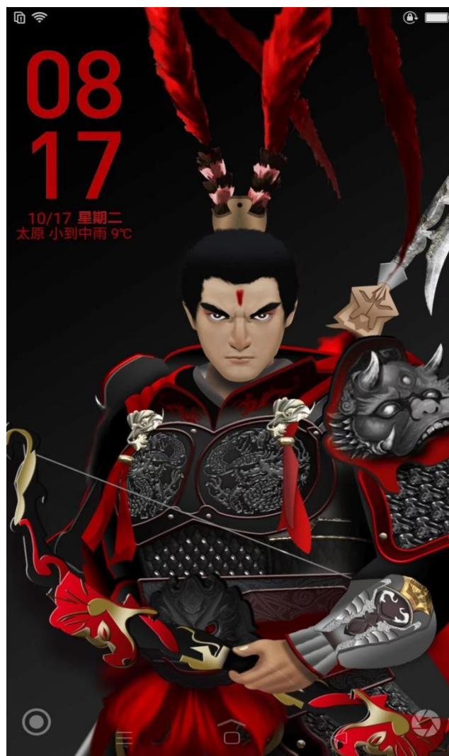
Pic. 1. A modern Chinese illustration to the Three Kingdoms corpus. Lü Bu. On this picture we can see traditional elements of Lü Bu's iconography: his Painted Piercing-Sky Halberd, his golden belt with a lion face, his headgear with pheasant feathers. The picture serves as a theme for an Oppo cellphone.

The emergence of figures like Lü Bu and Dong Zhuo – the fighting mercenaries and condottiers – on political scene of later Han period is very well explained by the renowned sinologist and translator Rafe de Crespigny. This is how he sets