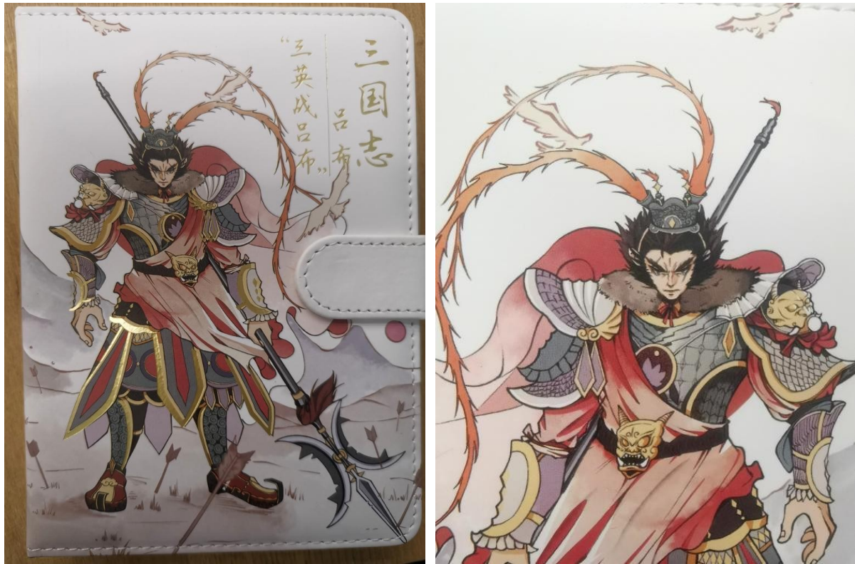
Pic. 8-9. A Japanese version of Lü Bu on a Japan-produced notebook imported to China. Traditional representation enforced by the tragic facial expression and the wounds on the failed hero's face.

became an inseparable part of Lü Bu's visualization. But where does the horse come from? How does it become the hero's best companion, a continuation of his body – to the extent that in order to kill Lü Bu the enemies had first to separate him from his horse?