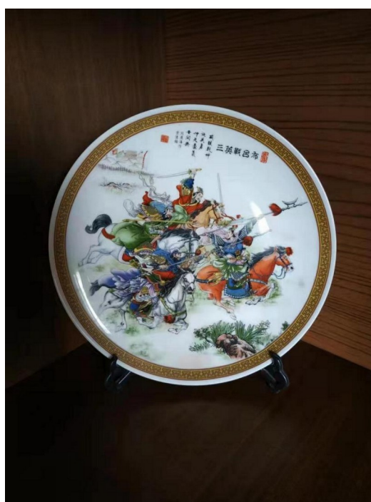
Pic. 5. Lü Bu fights against three warriors. A traditional image engraved on porcelain.